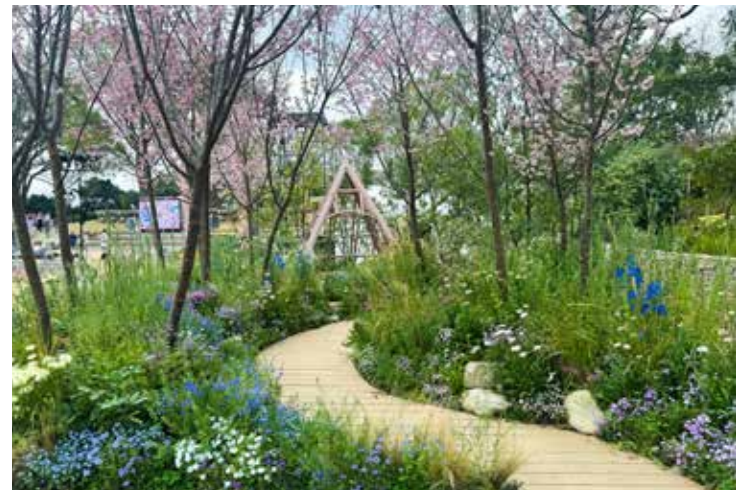
Photo : Fukuoka Flower Show Pre-Event